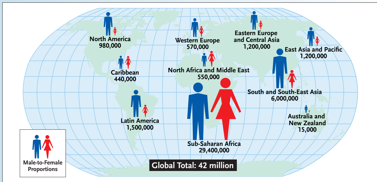
FIGURE 1. Estimated Number of Persons Living with HIV/AIDS, December 2002

In 2002, the U.S. Government announced a $500 million International Mother and Child HIV Prevention Initiative. Through a combination of improving care and drug treatment, it is hoped that this ini-