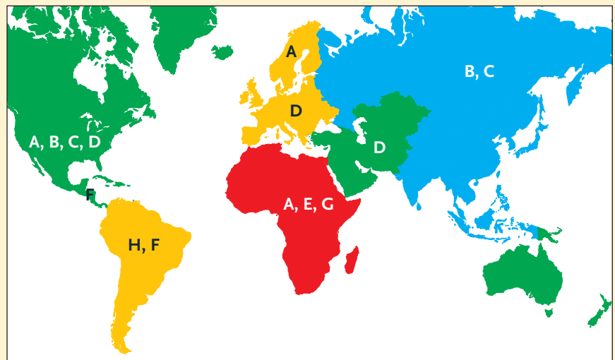
FIGURE 1. A New Element in the Terminology of Hepatitis B: Genotypes

Dr. Dieterich also stressed that different genotypes have different responses to treatment, as is touched upon later on in this article. "This raises a very important question," he said. "Should we be genotyping virus in our patients with chronic hepatitis B to see what their response to treatment might be?"