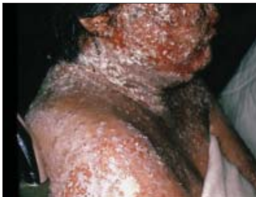
Figure 4. Eczema Vaccinatum