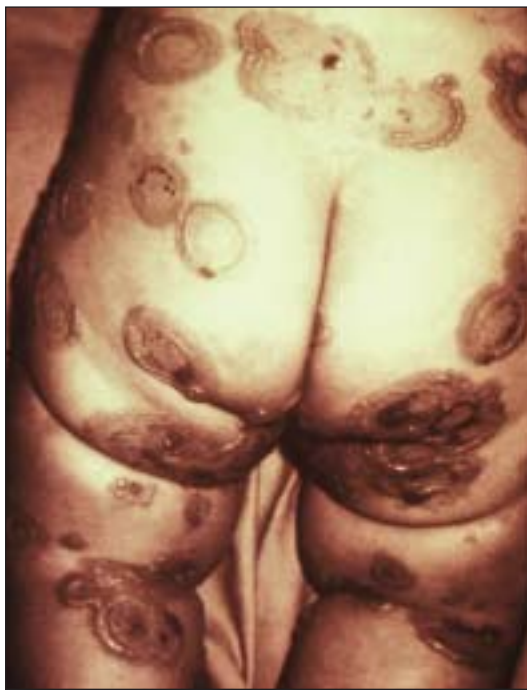
Figure 3. Erythema Multiforme

Massive doses of vIG are necessary to control viremia in patients with progressive vaccinia. Up to 10 ml/kg of intramuscular vIG has been used. In the event vIG is not available or is not effective in managing progressive vaccinia, the CDC lists cidofovir (Vistide)—a intravenously administered antiviral approved for the treatment of cytomegalovirus