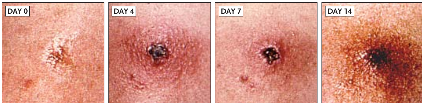
Figure 1. Successful Response to Smallpox Vaccination.

Two vaccines will be used in the coming years: the calf-lymph vaccine and a tissue culture cell vaccine. Dryvax, the stored calf-lymph vaccine manufactured in the 1970s by Wyeth Laboratories, is freeze dried (lyophilized) and must be reconstituted before use. This vaccine was pro-