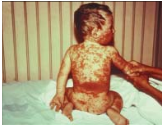
Figure 5. Generalized Vaccinia

Allergy to Vaccine Components: The currently available smallpox vaccine contains trace amounts of polymyxin B sulfate, streptomycin sulfate, chlortetracycline hydrochloride, and neomycin sulfate. Persons who experience anaphylactic reactions (e.g., hives, swelling of the mouth and