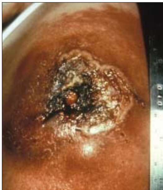
Figure 6. Progressive Vaccinia