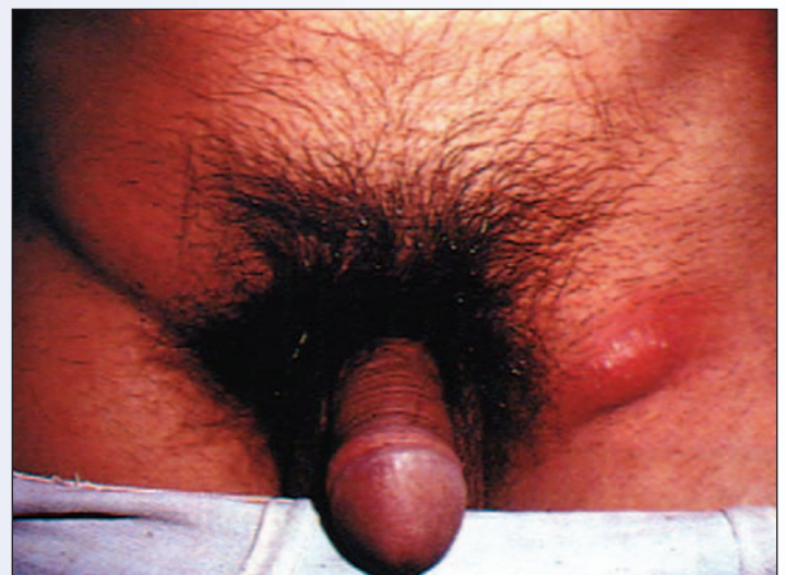
FIGURE 1. Inguinal Adenopathy in Secondary Lymphogranuloma Venereum

With respect to the diagnosis of LGV, commercially available tests—including culture, nucleic acid amplification, nucleic acid hybridization, and serologies—can be used to confirm C. trachomatis infection. However, these tests are not specific enough to distinguish between the various chlamydial serovars and therefore cannot be used to confirm a diagnosis of LGV. Definitive testing is available through the CDC, with the help of the New York City Department of Health and Mental Hygiene's Bureau of Sexually Transmitted Disease Control (BSTDC). Dr. Blank stated that all clinicians with a patient meeting the LGV case definition should call the BSTDC's LGV desk: (212) 788-4423 (see Sidebar).