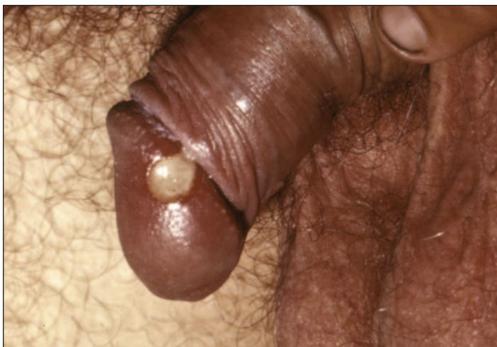
FIGURE 2. A Penile Chancroid Lesion

The classic triad of the chancroid ulcer involves a lesion with undermined edges (necrotic base), purulent dirty-gray base, and is associated with moderate to severe pain. Men typically present with genital ulceration, usually on the prepuce, coronal sulcus, or glans.