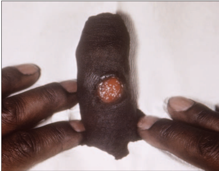
FIGURE 4. A Penile Syphilis Chancre

The most significant symptom of primary syphilis is the development of a solitary, painless ulcer or chancre at the infection site.