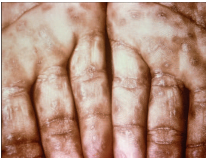
FIGURE 5. Secondary Syphilis